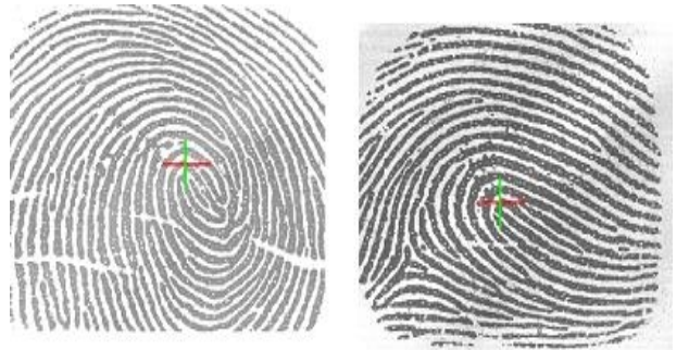
Figure 2. Results of core point detection based on multi-resolution method

Moreover, the algorithm can precisely localize the core point in the noise image, figure 4 shows the results of present algorithm detection on the noise image and the results of single-resolution based method. Therefore, we can draw the conclusion that the present algorithm more robust than Asker's method, meanwhile we do not need the post process steps to remove the false core point detected.